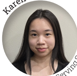
Richland Serving Seniors