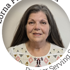
Prosser Serving Seniors