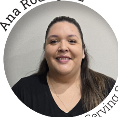
Parkside Serving Seniors