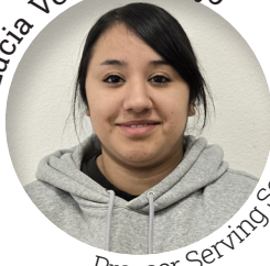
Prosser Serving Seniors